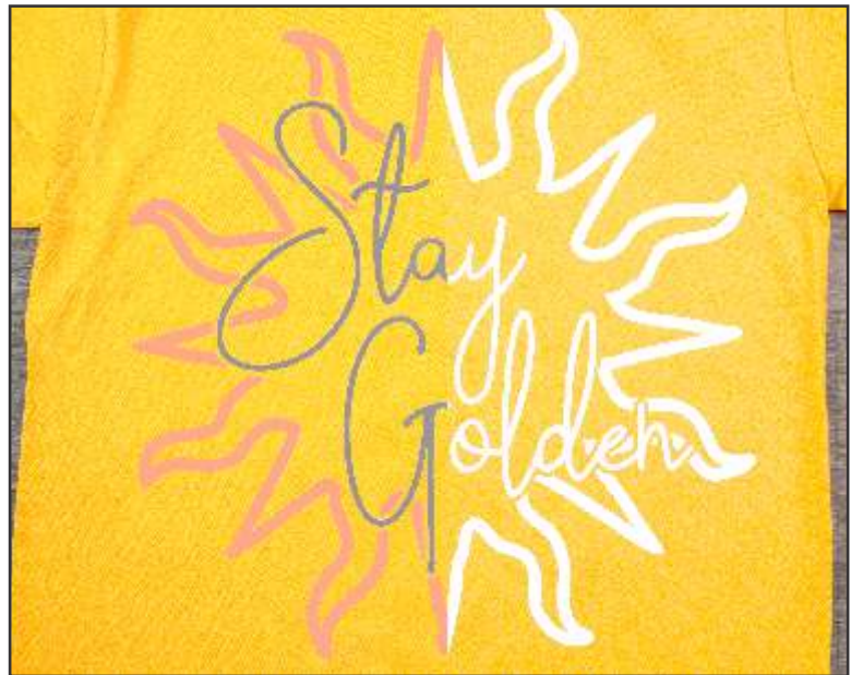
Before Heat Exposure

Wash inside-out with cool water, tumble dry